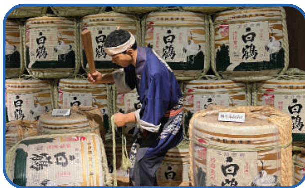
Day 3 - Hakutsuru Sake Brewery Museum

We'll then head to lunch at a local restaurant and try one of Kobe's most significant culinary exports— kobe beef —a special grade of beef from Wagyu cattle raised in Kobe, Japan. These cattle are massaged with sake and are fed a daily diet that includes large amounts of beer. This produces meat that is extraordinarily tender, finely marbled, and full-flavored.