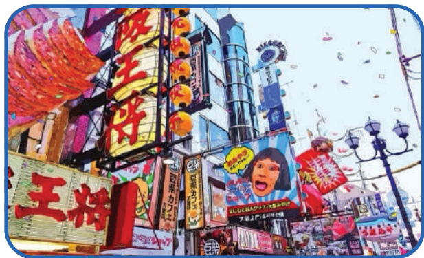
Day 4 - Dotonbori

Kuromon Market: Known as the “Kitchen of Osaka”. It’s where many of the city’s chefs get their supplies.. It’s made up of one main walking street with about 150 shops selling mostly fresh fish, seafood, meat, fruits, and vegetables.