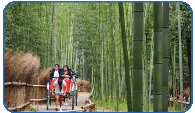
Day 7 - Arashiyama Bamboo Grove

We begin our day with a visit to Arashiyama , a heavily Buddhist influenced area. Start to visit Tenryuji Temple , the head temple of the Tenryu sect of Rinzai Zen Buddhism and official UNESCO World Heritage Site . Founded in 1339, this temple is best known for its beautiful cultural artwork and tranquil Sogenchi pond and garden, one of the oldest landscape gardens in Kyoto.