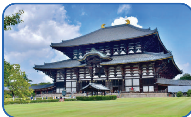
Day 5 - Tōdai-ji Temple

After breakfast, please meet in the lobby by 8:30 am as we’re off to Nara and Kyoto.