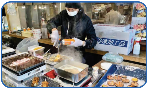
Day 8 - Tsukiji Fish Market

Please meet in the lobby by 8:30 am after breakfast.