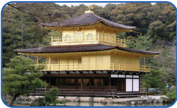
Day 6 - Kinkakuji Temple (Golden Pavilion)

temple. In addition to the gold-leaf on Japanese lacquer that wraps around the 2nd and 3rd floors, a Buddhist era inspired beautiful garden and “Mirror Pond” encircling the Temple reflects the delicate balance between tranquility and the Temple’s grandiose facade.