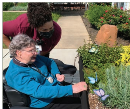
Deupree Cottage residents and staff pick fresh herbs from the raised-bed garden they planted and tend.