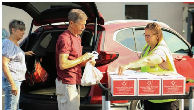
We are seeking funding for an awning to protect volunteers from heat and inclement weather.