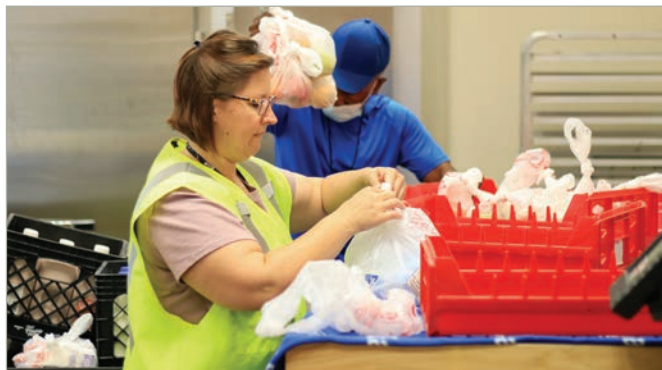
The new space provides free delivery from our meal provider, has a customized meal assembly workspace.