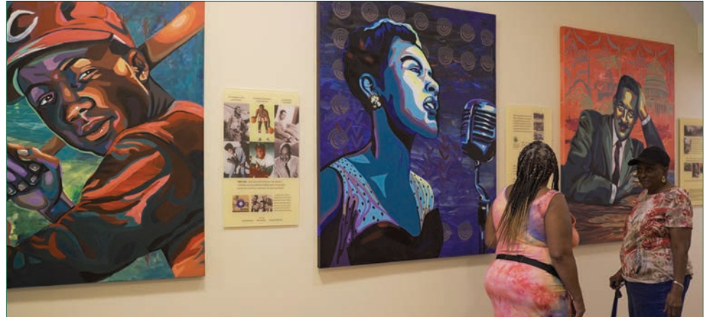
Residents enjoy the historical display that was made possible by generous donors.