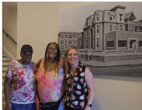
The ArtWorks mural and artwork in the common areas enhance the community for the benefit of residents, visitors, and staff.